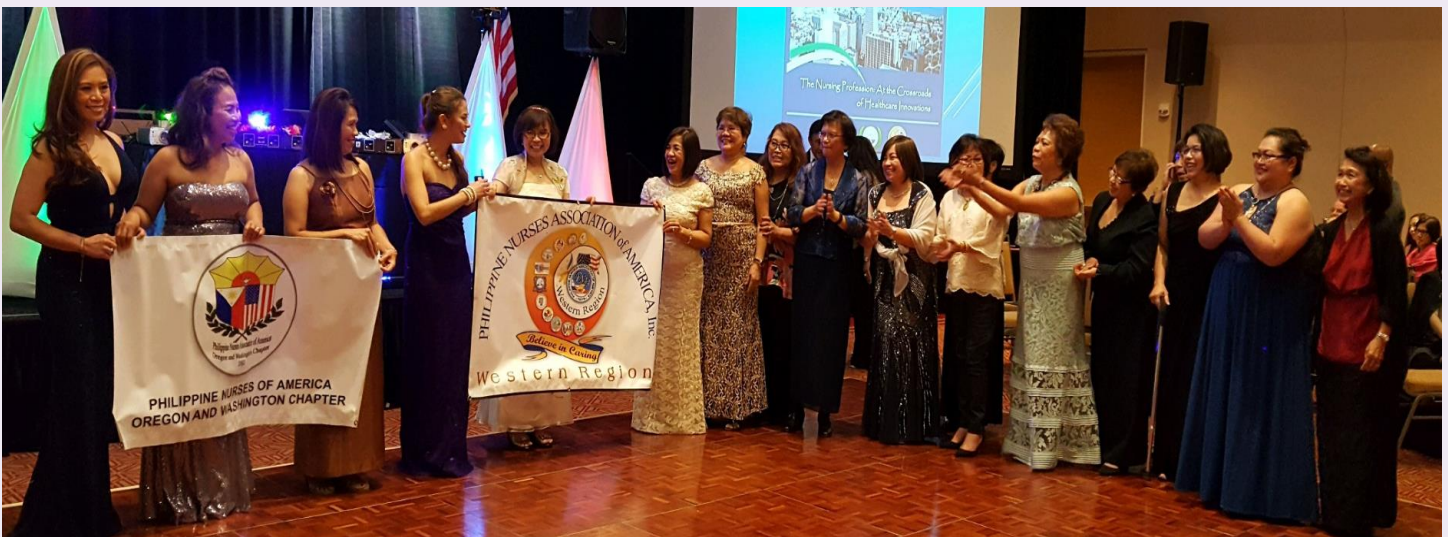
PNA Northern C delegates with WR VP during the relegation of the next WR conference to PNA Oregon/Washington delegates!